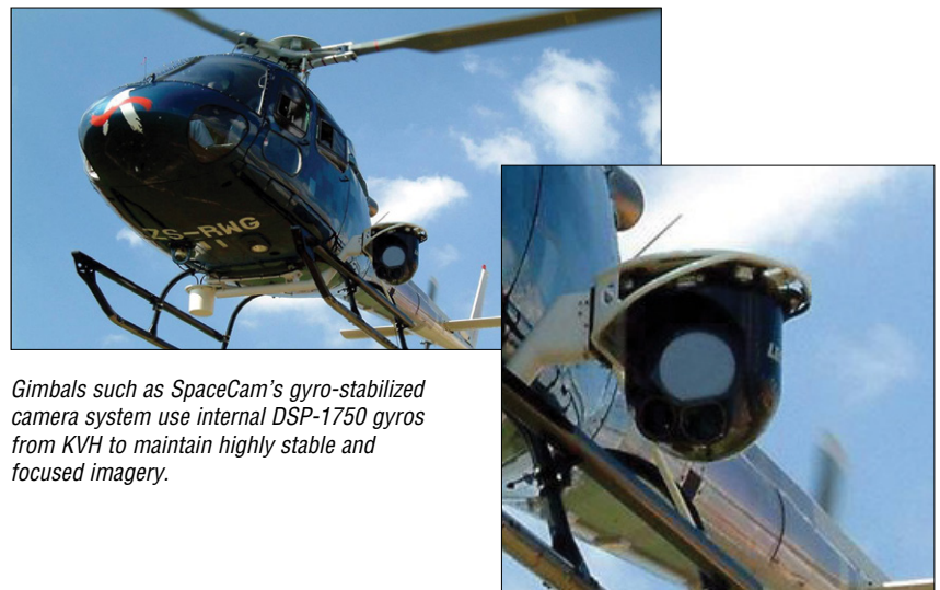
Gimbals such as SpaceCam's gyro-stabilized camera system use internal DSP-1750 gyros from KVH to maintain highly stable and focused imagery.

KVH is the only U.S. FOG manufacturer that draws its own optical fiber, ensuring consistent quality, performance, and instant turn-on to turn-on repeatability in every FOG. And like all of KVH's precision FOGs, the solid state DSP-1750 is built using KVH's patented Digital Signal Processing (DSP) electronics design which offers significant improvements in such critical areas as scale factor and bias stability, scale factor non-linearity, and maximum input rate.