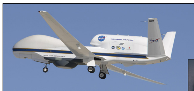
NASA's Global Hawk carrying a synthetic aperture radar payload (inset) on a fully unmanned aerial recon mission uses internal DSP-1750 gyros from KVH to maintain focused and stable imagery.

KVH is the only U.S. FOG manufacturer that draws its own optical fiber, ensuring consistent quality, performance, and instant turn-on to turn-on repeatability in every FOG. And like all of KVH's precision FOGs, the solid state DSP-1750 is built using KVH's patented Digital Signal Processing (DSP) electronics design which offers significant improvements in such critical areas as scale factor and bias stability, scale factor non-linearity, and maximum input rate.