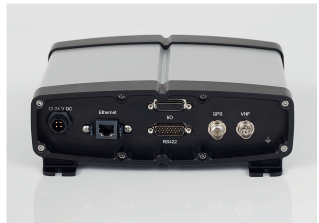
R5 SUPREME Transponder rear view