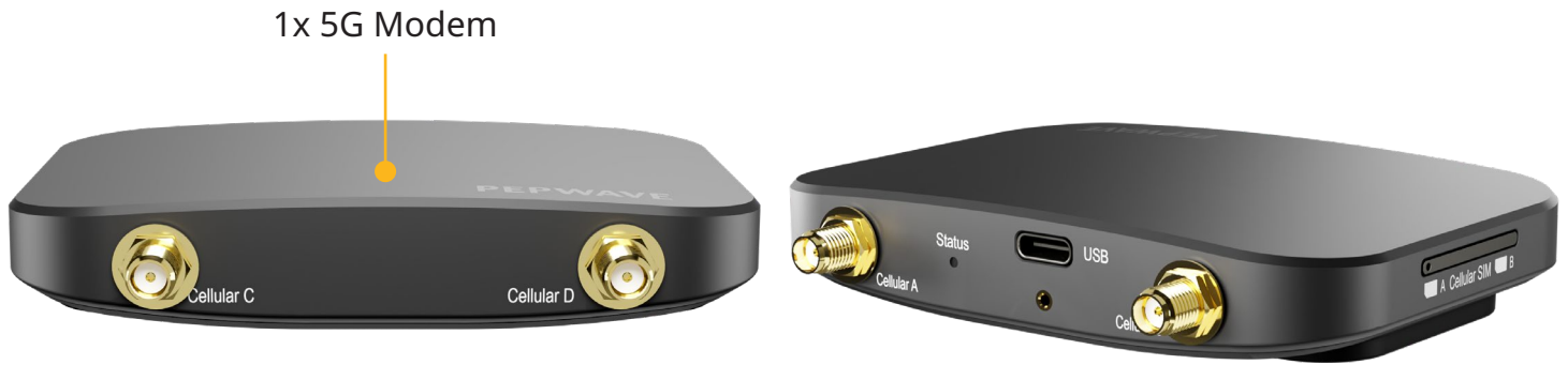
1x 5G Modem